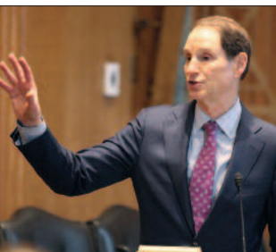
U.S. Senator Ron Wyden (D-OR), Chairman, Senate Committee on Finance